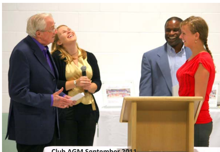
Club AGM September 2011

THE COMMUNITY: 43 NEIGHBOURHOODS SERVED Over 15,000 Individuals were served in total, including Children & Youth, Seniors, 'Students, Volunteers and Families living in the City of London and Middlesex County