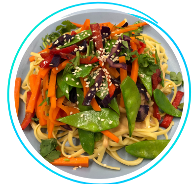
Thai Peanut Noodles

Food safety continues to be our top priority.