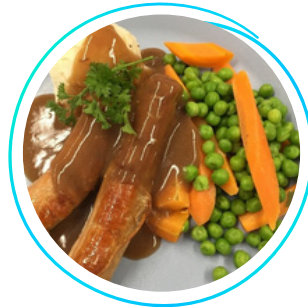
Bangers and Mash

Creamy, baked mac 'n cheese with bacon throughout, served with a side of green beans.