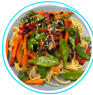
Thai Peanut Noodles

An exciting Thai-inspired Noodle dish with a medley of fresh vegetables in a delicious, silky peanut sauce.