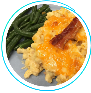
Bacon Mac n' Cheese

Creamy, baked mac 'n cheese with bacon throughout, served with a side of green beans.