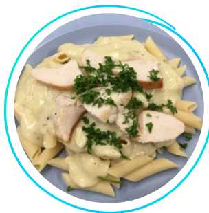
Creamy Chicken Pesto Penne

Two corn tortillas filled with chicken and brown rice, topped with cheddar cheese and house made red and green enchilada sauces, and with warm roasted corn salad on the side.